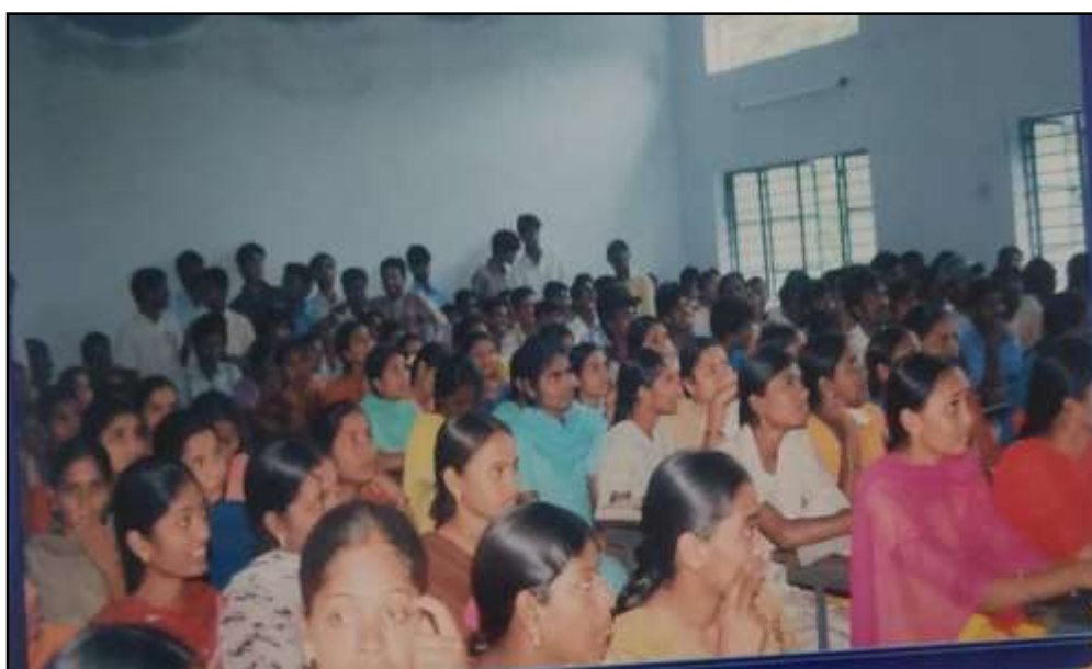
Student's participation in the programme on 28-11-2016